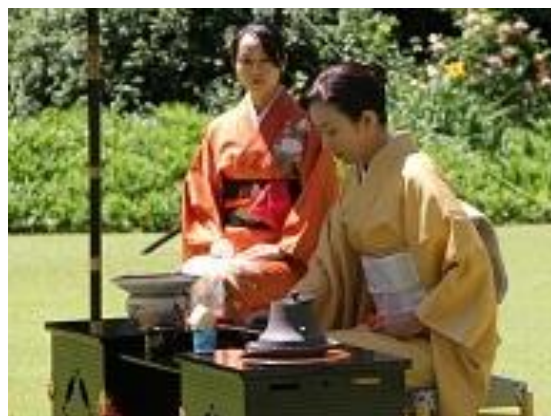
Members of the Japanese Tea Ceremony Club