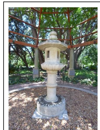
Stone lantern at the Company's Garden in Cape Town

Company's Garden Tel: 021-400-2521 Address: Queen Victoria Street, Cape Town (at the top end of Adderley Street)