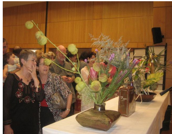
Three of the ten flower arrangements