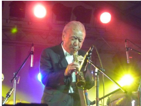
Mr. Sadao Watanabe

On August 27 th and 28 th , Mr. Sadao Watanabe, Japan's foremost Jazz musician, performed at the Standard Bank Joy of Jazz Festival held in Newtown in Johannesburg. The event was attended by internationally renowned artists.