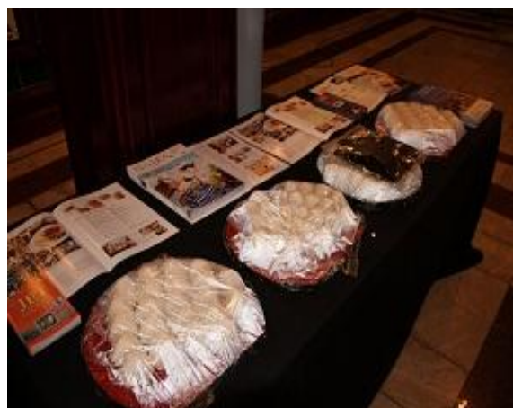
Japanese Onigiri, rice balls