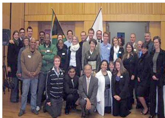
JET Pre-departure Reception (2010 July 23 : Embassy of Japan)