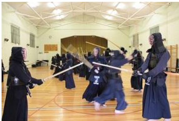
Kendo Seminar (2010 October 16 – 17)