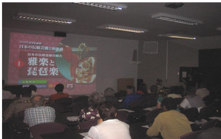
DVD Lecture on traditional Japanese Theatre at KZN University in Durban (2010 March 4)