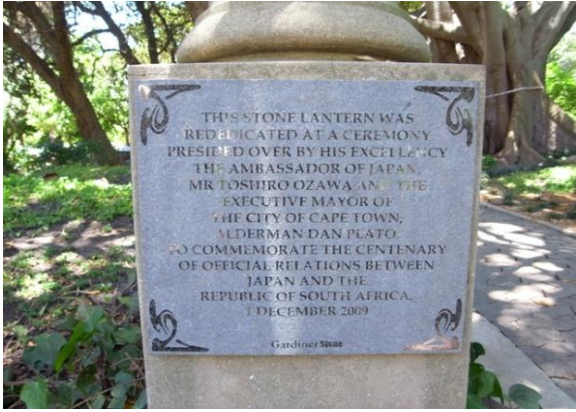
Plaque on the Japanese stone lantern at the Company's Garden in Cape Town