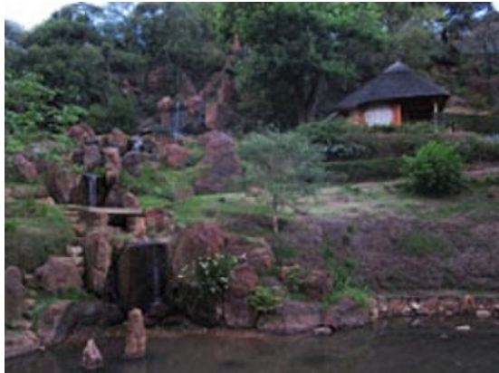
Japanese garden and tea house