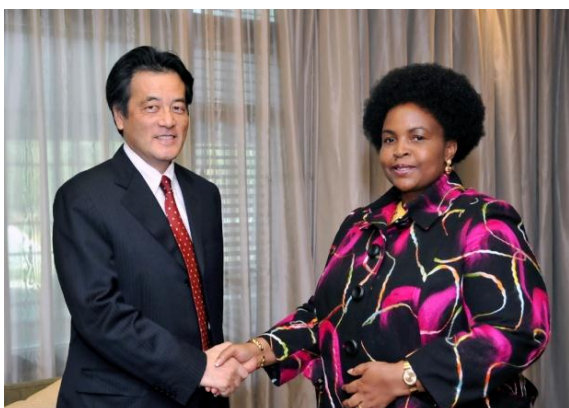
Japanese Foreign Minister Mr. Katsuya Okada and Ms. Maite Nkoana-Mashabane, Minister of International Relations and Cooperation (2010 April 30)

Currently, Japan is South Africa's third biggest export destination and fourth biggest import source (2009). Japan and South Africa work together on global issues such as nuclear disarmament and non-proliferation, reform of the UN Security Council and climate change.