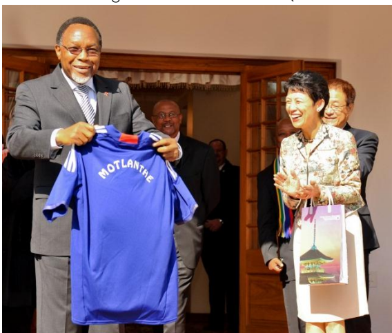
Princes Takamado presenting Deputy President, Kgalema Motlanthe, with the official Japanese soccer uniform with his name (2010 June 25)