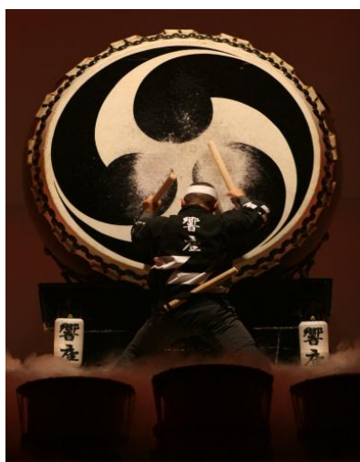
Hibikiza (Wadaiko) at State Theatre (2010 September 3 - 4)