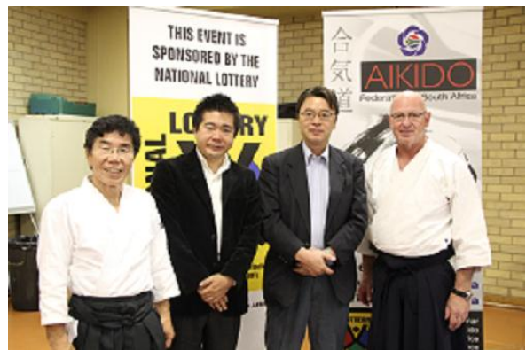
Aikido Seminar at Wits University in Johannesburg (2010 November 25 – 28)