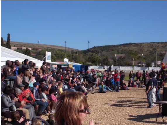
Drum performance (Outdoor venue) (2010 July 1)

From July 1 st to 3 rd , AGA-SHIO, a piano and Shamisen (Japanese three string instrument) duo, and Music & Rhythm, a Japanese drum and bamboo instrument combination group, performed at the 36 th Grahamstown National Arts Festival. This was the first time that Japanese performers participated in the festival. The performers also made a visit to the Orlando Children's Home in Soweto.