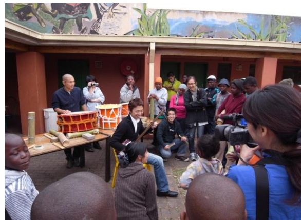
Orlando Children's Home in Soweto (2010 June 28)