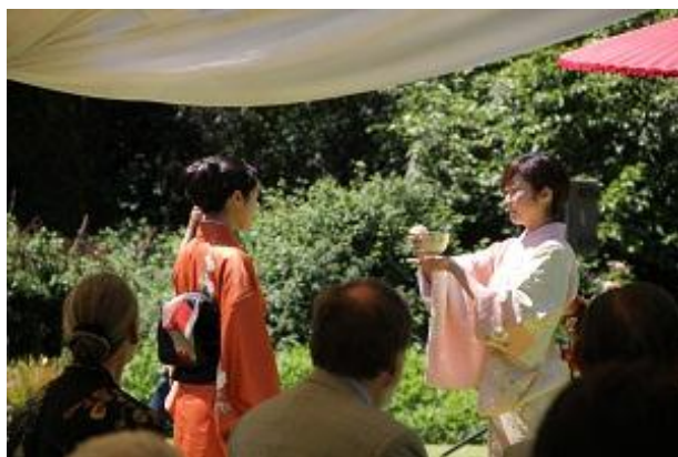
Tea Ceremony Demonstration