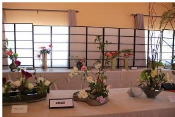
Ikebana exhibition at Monument Park Dutch Reformed Church Hall in Pretoria (2010 October 14 – 16)