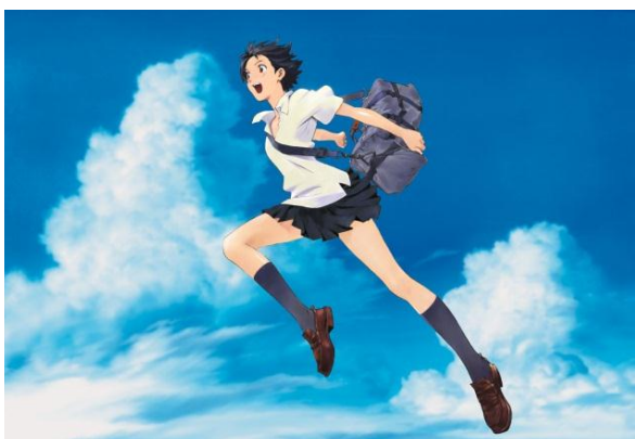
The Girl who Leaped through Time