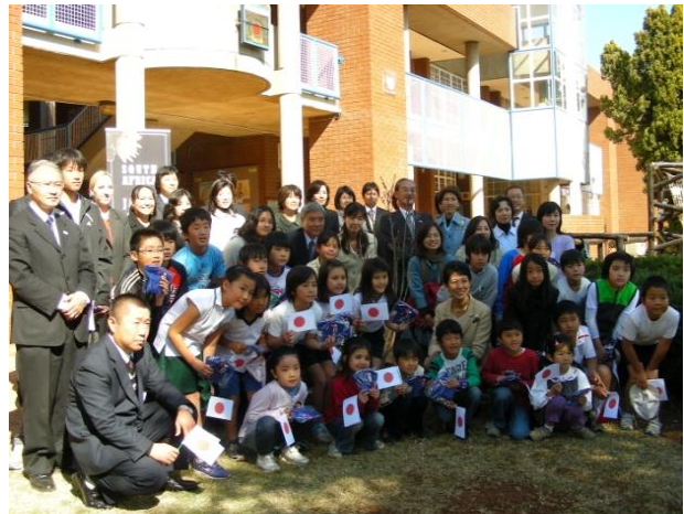
Japanese School in Johannesburg (2010 June 23)