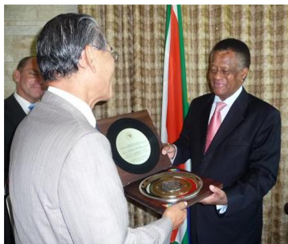
Ambassador Ozawa and Speaker of the National Assembly, Hon. Max Sisulu at National Assembly in Cape Town (2010 November 26)