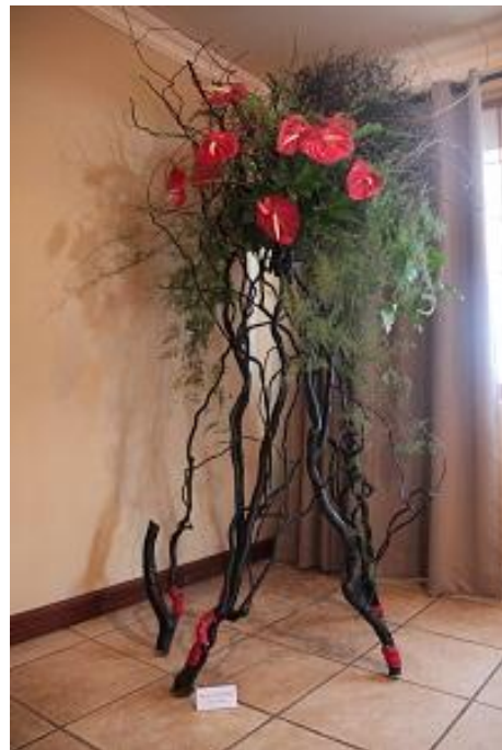
Ikebana Displays for Christmas, New Year and Special Occasions