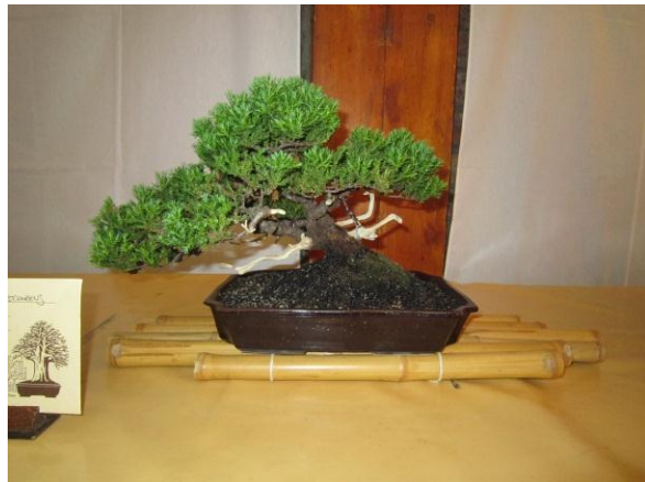
Bonsai exhibition at Floreum in the Johannesburg Botanical Gardens (2010 October 30 – 31)