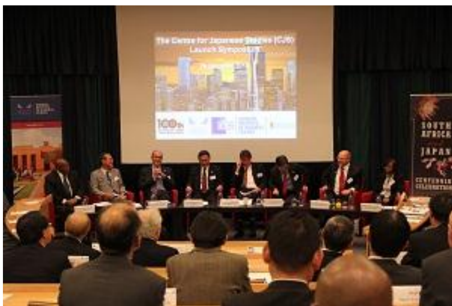
Launch Symposium of the Centre for Japanese Studies at GIBS (2010 October 26)