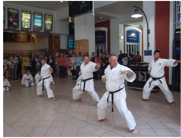
Karate Demonstration (Cape Town)