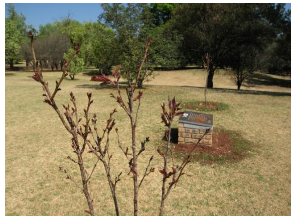
Cherry blossom buds start to appear (September, 2010)