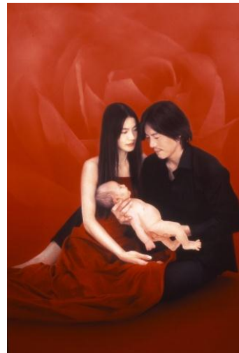
A poster from the film Life