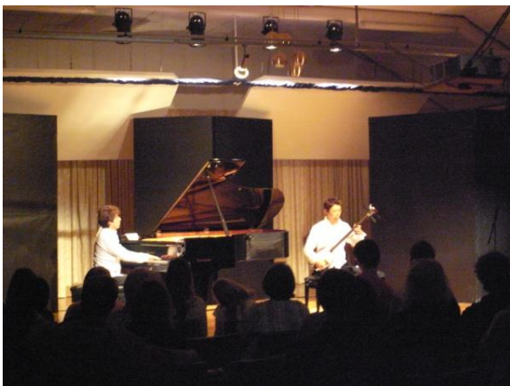
Performance by AGA-SHIO (2010 July 3)