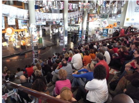
Drum performance (Indoor venue) (2010 July 2)