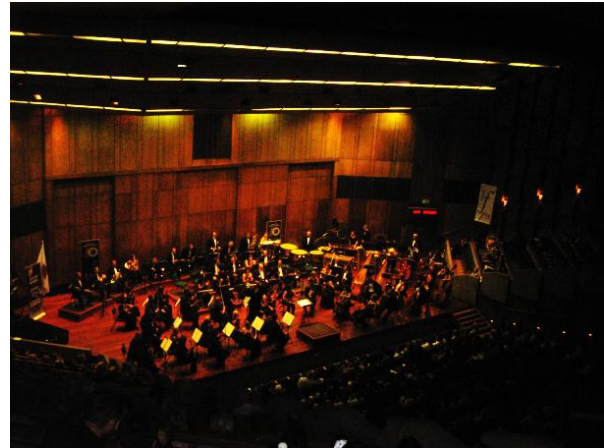
Concert at the Linder Auditorium (2010 March 10 - 11)