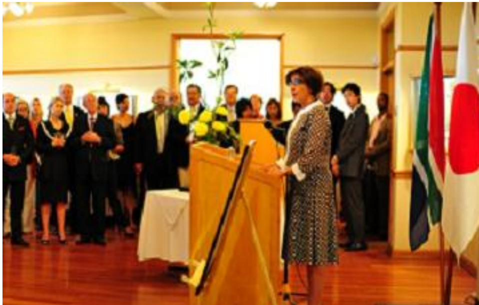
Deputy Minister of International Relations and Cooperation, Ms. Sue van der Merwe at the National Day reception to kick off the Centennial Celebrations in Cape Town (2009 December 1)