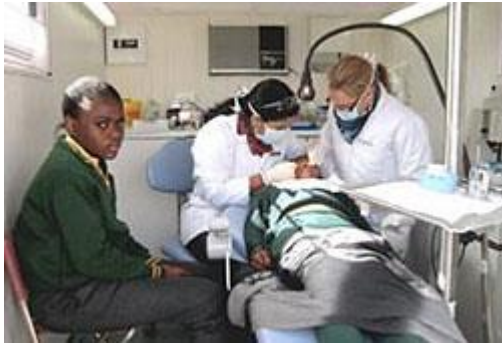
Students of the Boschkop Primary School receiving treatment in the Mobile Dental Clinic